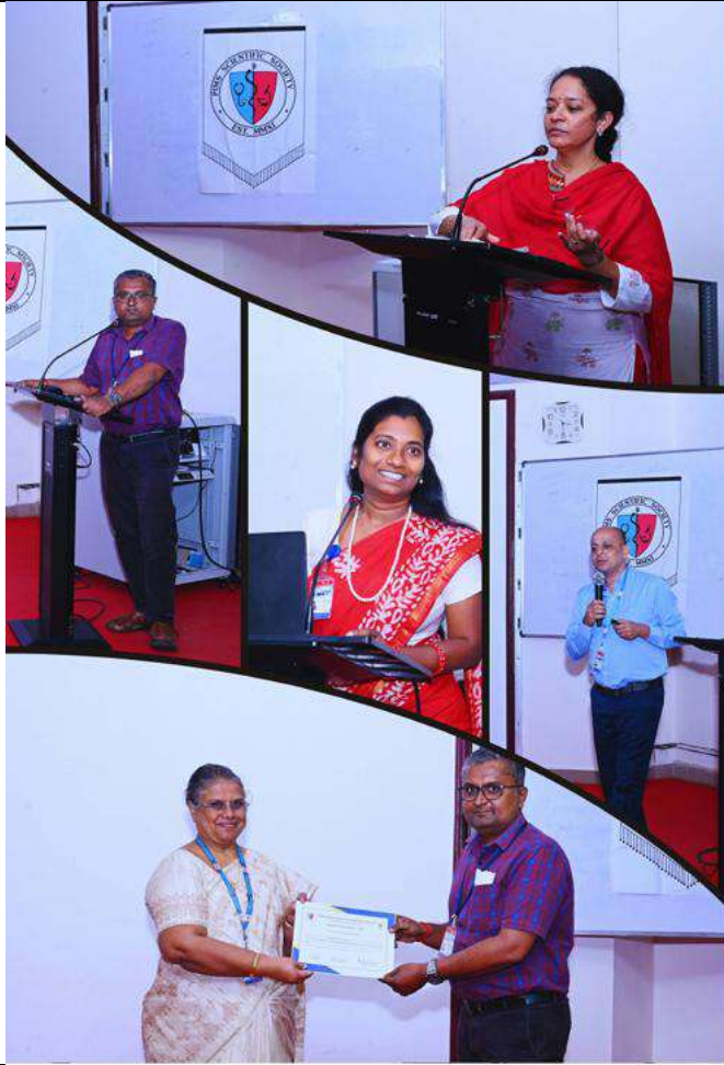
CME- Digital Detox in Medicine : Reclaiming, focus, compassion and clarity